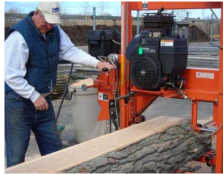
Member Projects shown at the May meeting.