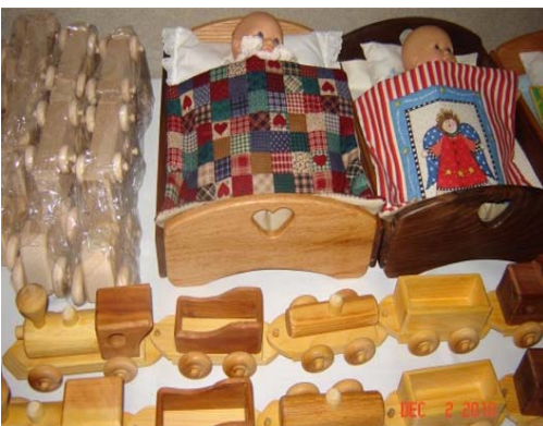
And more Toys!