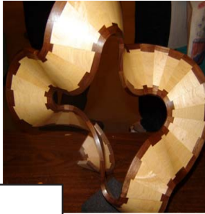
Jerry Tackes Sculpture