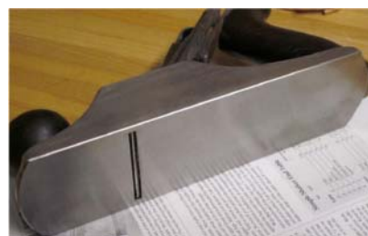
The plane after Steve worked on it.