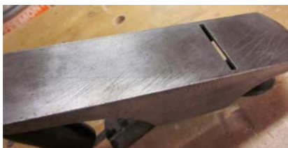
The plane before re-machining