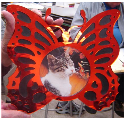
Dirk & Karen made a picture frame out of colored plexiglass

Go to the Woodcraft webpage for further details on these classes. www.woodcraft.com