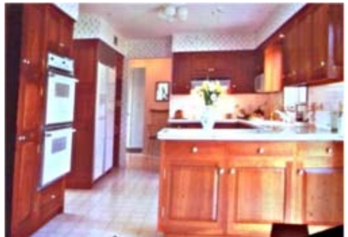
Frank Klausz Kitchen (He made all Cabinetry)

Woodworking For Women , Wed, Apr 28, 6 PM - 9 PM