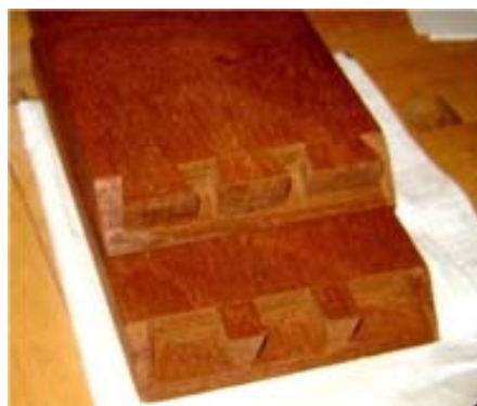
Making Handcut Dovetails