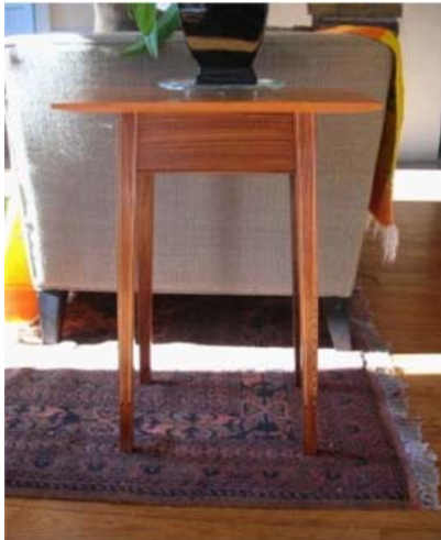
Garrett Hack Splay Leg Table

wiscwoodworkersguild@wiscwoodworkersguild.org